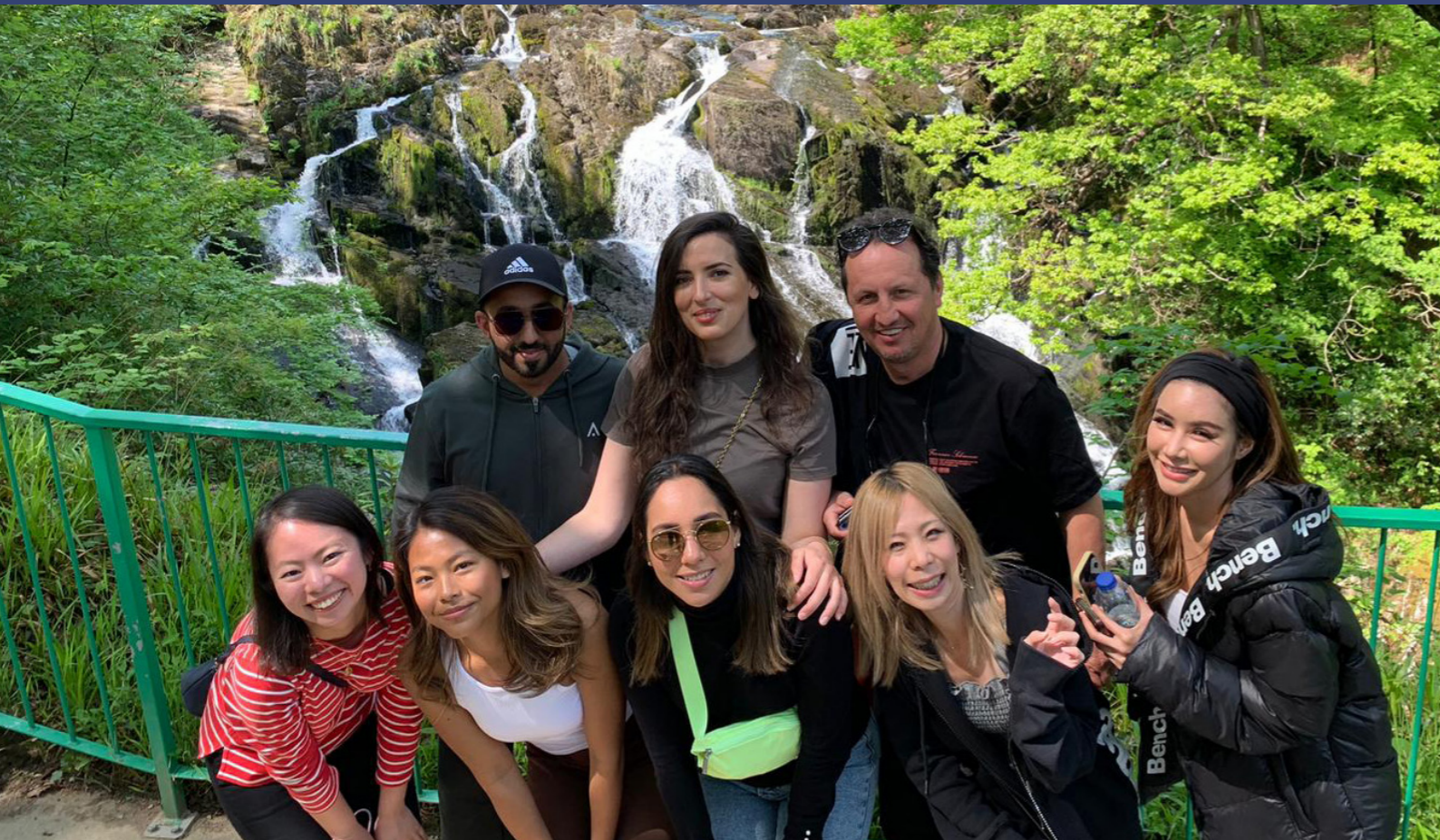
Swallow Falls Betws-y-Coed, North Wales Summer 2023