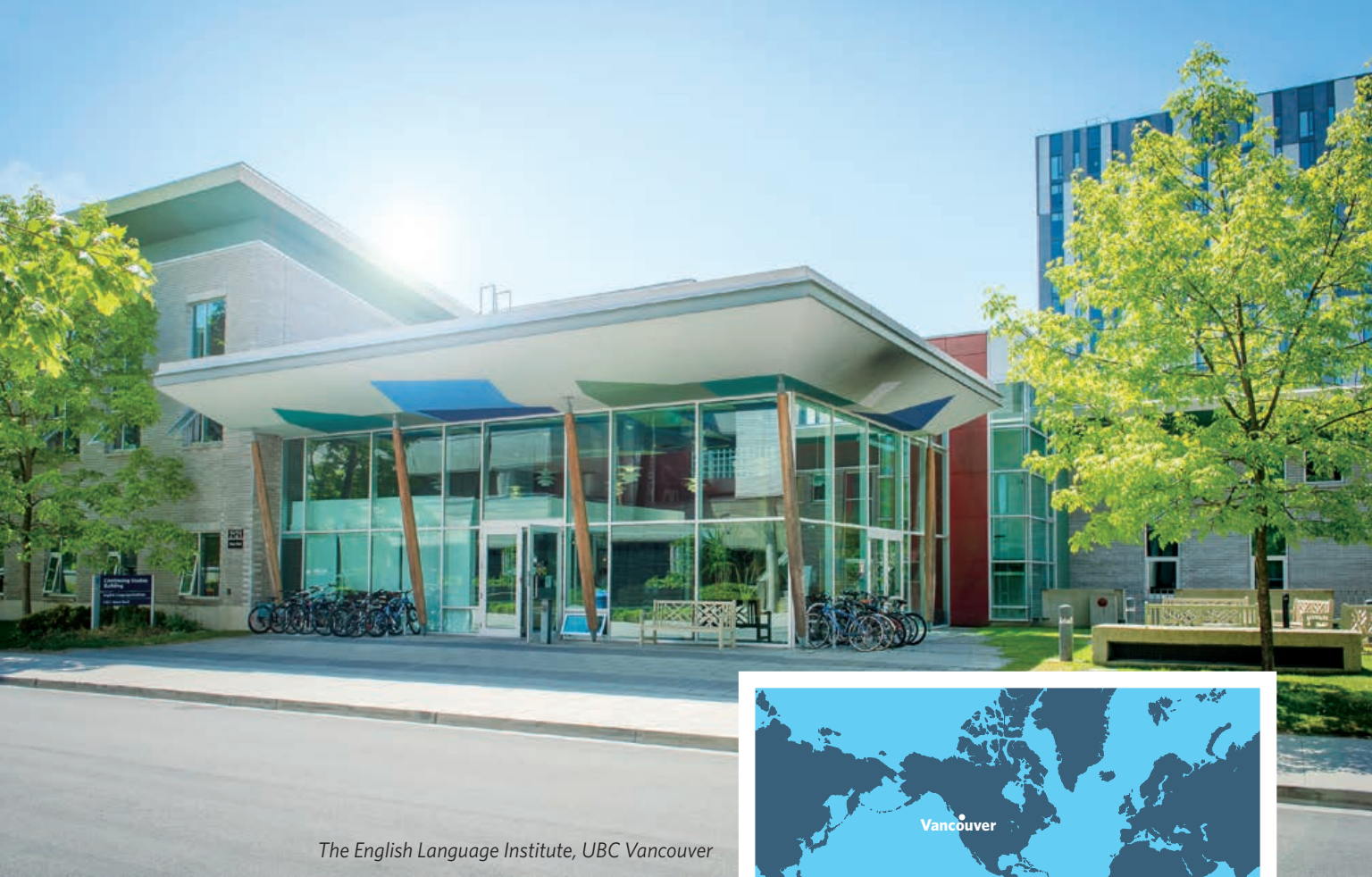
The English Language Institute, UBC Vancouver